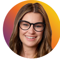
Ashley Stewart President